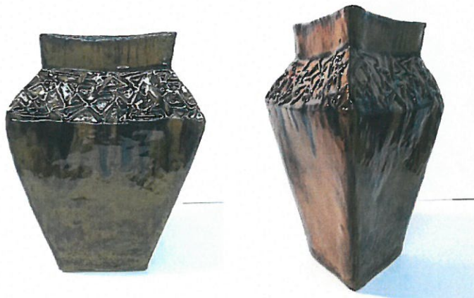
Title: Tetrahedron by Tyler Dupee

Description: Representing the ability to progress and evolve, Blue Herons send a message to people about self-reliance. After constructing the slab coil vase, porcelain slip was applied to the surface. Once the slip dried, the blue herons were carefully carved through the slip. After the birds were completed their ecosystem was carved into place. This vase also displays the strength and pride of being an individual and standing alone.