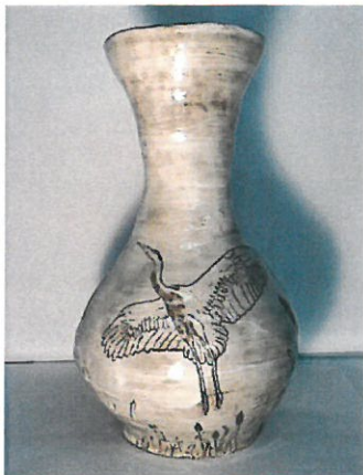
Title: The Great Blue Heron by Kennedy Carlson

Description: Representing the ability to progress and evolve, Blue Herons send a message to people about self-reliance. After constructing the slab coil vase, porcelain slip was applied to the surface. Once the slip dried, the blue herons were carefully carved through the slip. After the birds were completed their ecosystem was carved into place. This vase also displays the strength and pride of being an individual and standing alone.